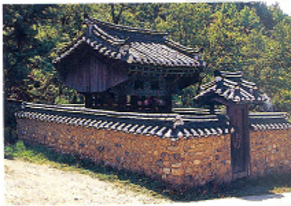
Jeongnyeo-gak Monument House

After passing a pagoda tree, you can go up to the village. There is Jeongnyeo-gak Monument House which is surrounded by a low tile-capped wall on your right. The building was the monument for Choi Heung-won, who was a royal guard of the Crown